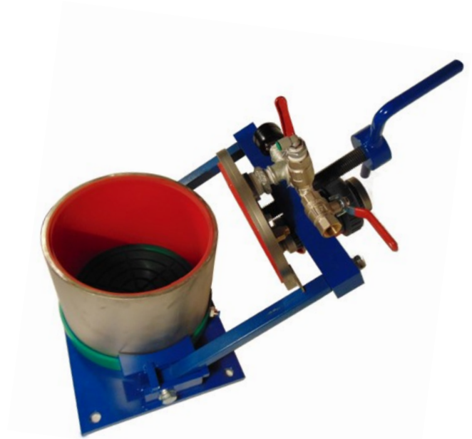
Pressure filter with PU coating

the higher the type the more resistance, causing less liquid to go through.