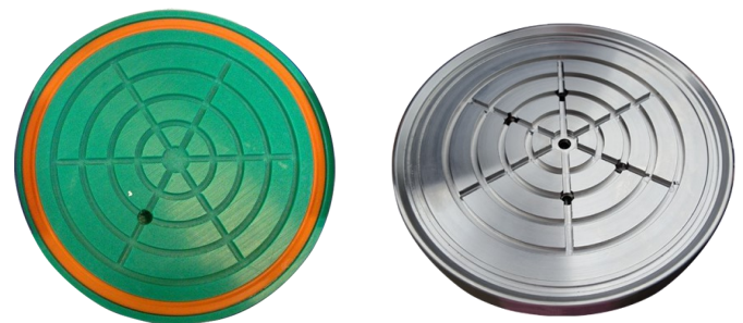
Stainless steel and PU labrith pressure filter