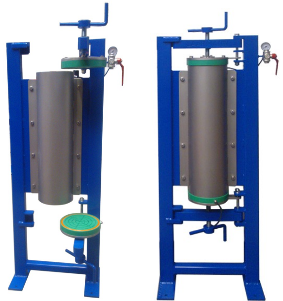
LMPF Pressure filter double spindle version

The Pressure Filter features a removable barrel, on a fixed base plate mounted on a table (TM) or put on the floor (FM). The lid is hinged and positioned via a screw. Control is achieved as on the larger units with an additional ball valve for introducing slurry to the filter.