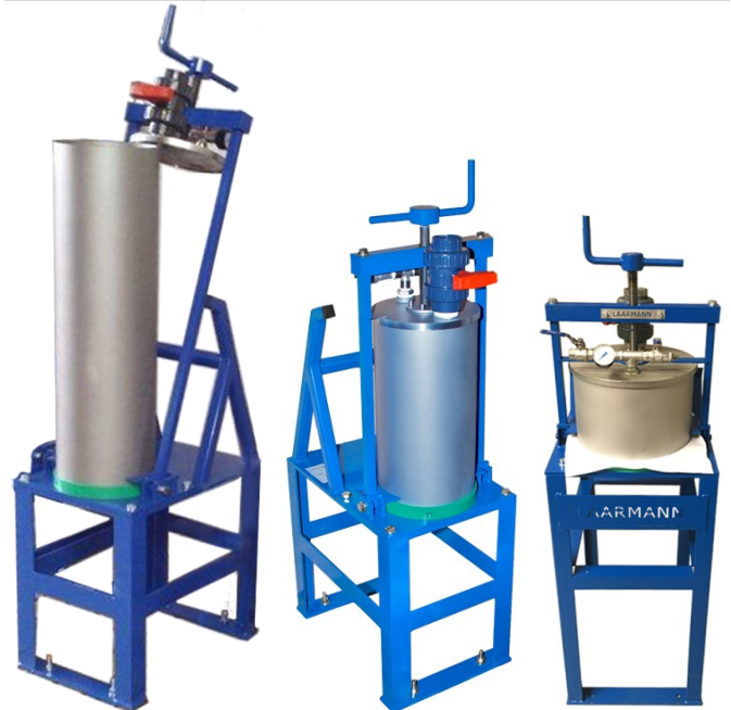
LMPF Pressure filter floor mounted version with frame