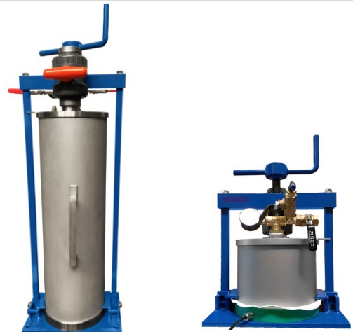
LMPF Pressure filter floor mounted version